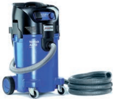
WAP 12 Gallon Wet/Dry Vac with Hose & Wand