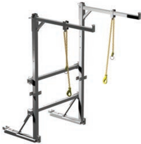
Bolt Down Frame

Please call for Rental pricing on this item.