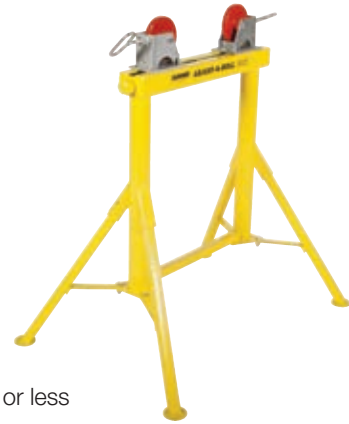
4-Legged Adjustable Pipe Stand