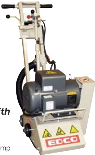
8" Electric Scarifier with Drum and Cutters