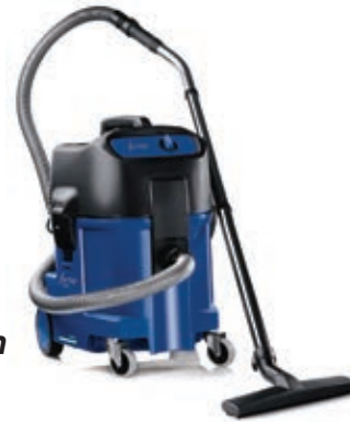
WAP 12 Gallon HEPA Vac