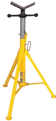
Vee-Head Jack Stand