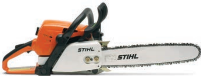
Gas Chain Saws