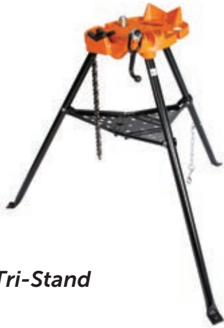
RIDGID 460 6" Tri-Stand Chain Vise