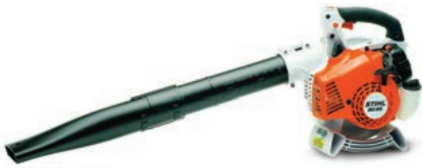
Stihl BG86 Gas Hand Held Blower