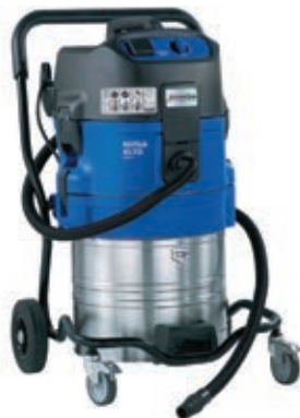
Alto 19 Gallon Wet/Dry Vac (Attix 19)