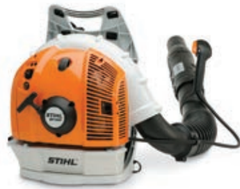
Stihl BR550 Back Pack Blower