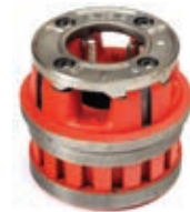
12R Die Heads with Dies