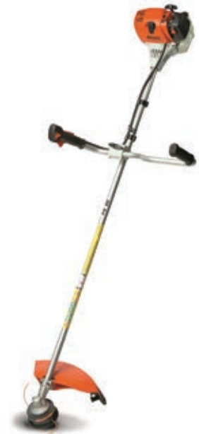
Stihl FS90 Trimmer with Bike Handle