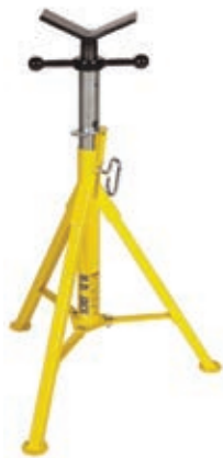
Lo Vee-Head Jack Stand