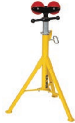
Roller Head Jack Stand