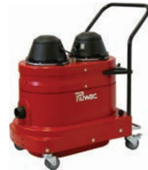
Ruwac Two Tool Dust Extraction Vac