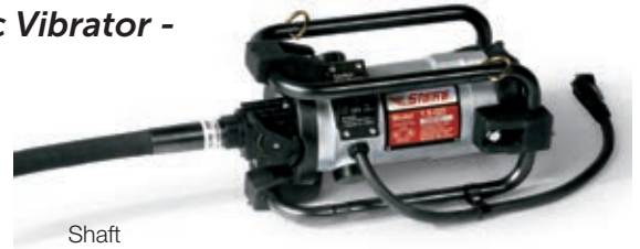
Electric Vibrator - 115V