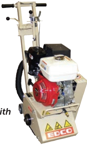
8" Gas Scarifier with Drum and Cutter